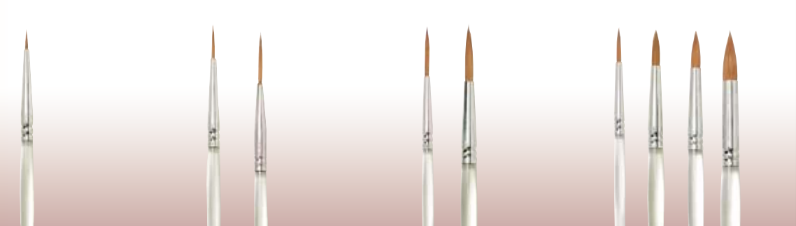
TB 720 No. 1/0 Detail For small details and brushstrokes.