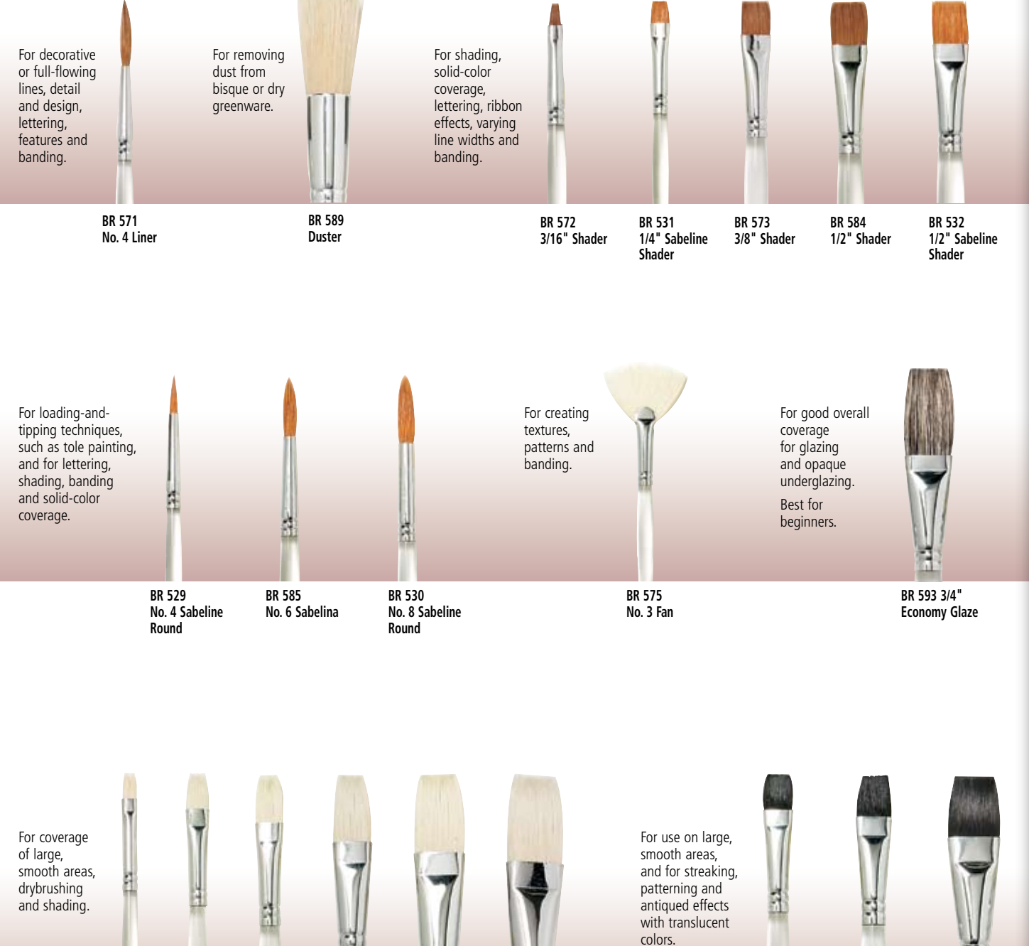
BR 554 BR 555 No. 1 Flat Opaque