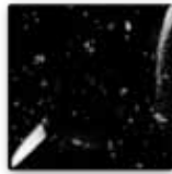
IN1216 Very Black Sprinkles