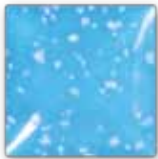
IN1211 Neon Blue Sprinkles