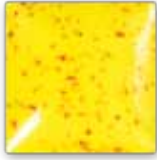
IN1209 Neon Yellow Sprinkles