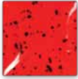
IN1207 Neon Red Sprinkles