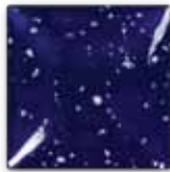
IN1212 Cobalt Blue Sprinkles