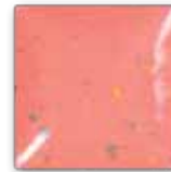
IN1214 Honeysuckle Sprinkles