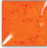
IN1208 Neon Orange Sprinkles