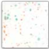
IN1215 White Sprinkles