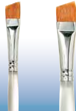
BR 603 1/4" Angular Shaver BR 602 1/2" Angular Shaver

For the same brushstrokes created with straight Shaders, with the added advantage that the point reaches small areas and the points of squares and triangles.