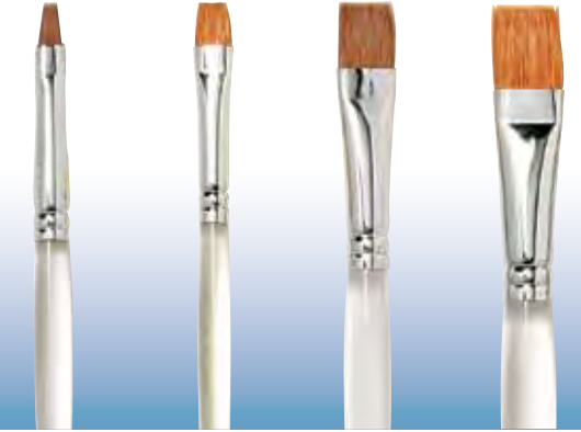
BR 572 3/16" Shaver BR 531 1/4" Sabeline Shaver BR 573 3/8" Shaver BR 532 1/2" Sabeline Shaver

For shading, solid-color coverage, lettering, ribbon effects, varying line widths and banding.