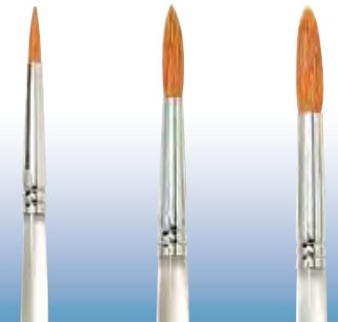
BR 529 No. 4 Sabeline Round BR 585 No. 6 Sabelina BR 530 No. 8 Sabeline Round

For loading-and-tipping techniques such as tole painting, and for lettering, shading, banding and solid-color coverage.