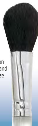
BR 588 No. 10 Oval Mop

For application of glaze and underglaze to broad areas.