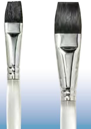
BR 559 1/2" Flat Translucent BR 545 3/4" Flat Translucent

For use on large, smooth areas, and for streaking, patterning and antiqued effects with translucent colors.