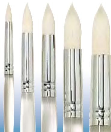
BR 551 No. 3 Round Opaque BR 552 No. 5 Round Opaque BR 553 No. 8 Round Opaque BR 604 No. 10 Round Opaque BR 605 No. 12 Round Opaque

For solid-color coverage, drybrushing and design work.