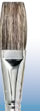
BR 593 3/4" Economy Glaze

For good overall coverage; ideal for glazing and opaque underglazing. Recommended for beginners.