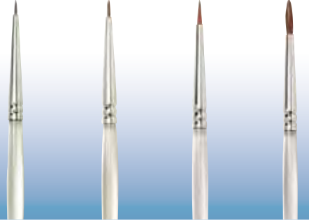
BR 596 No. 7/0 Fine Detail BR 582 No. 5/0 Detail BR 570 No. 2/0 Detail BR 520 No. 2 Detail

For fine design work, small lettering and delicate detailing.