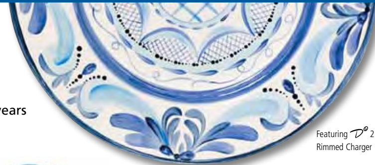
Featuring D 21700 Rimmed Charger