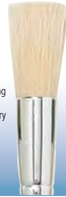
BR 589 Duster

For removing dust from bisque or dry greenware.