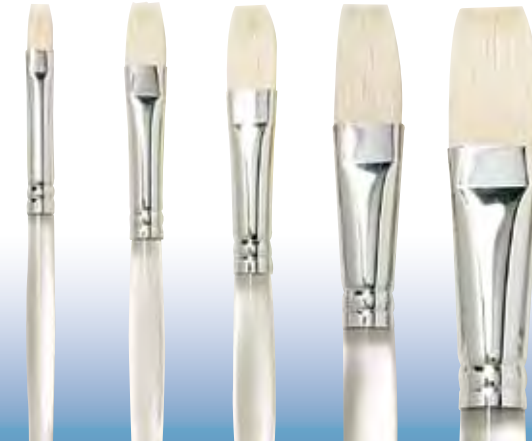
BR 554 No. 1 Flat Opaque BR 555 No. 3 Flat Opaque BR 556 No. 5 Flat Opaque BR 557 No. 8 Flat Opaque BR 606 No. 10 Flat Opaque

For coverage of large, smooth areas, drybrushing and shading.